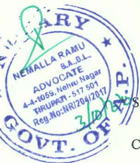
(Dr. M.Mohan Babu) Chairman

Sree Vidyanikethan Educational Trust Sree Sainath Nagar, A. Rangampet Chandragiri Mandal, Chittoor District - 517 102, A.P