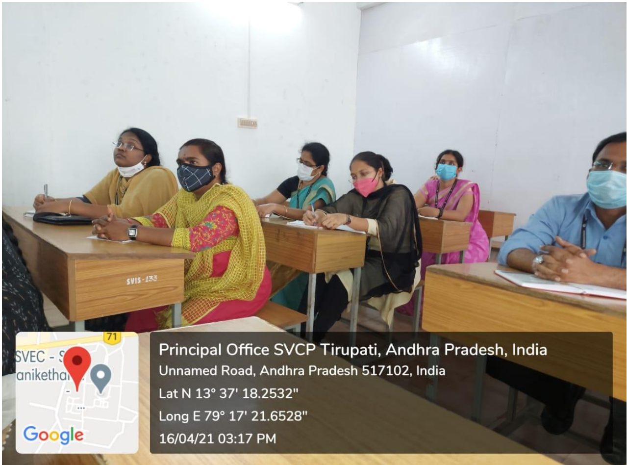
Glimpse during the talk